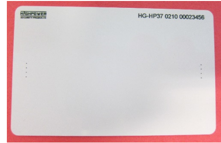
Highpower Select Printable ISO .032" thick and .046" thick high durability printable cards. Part # HG or HX Black Printing included one side or optional full color printing

Cost effective 125 KHz proximity cards, wafers and keyfobs available in a variety of formats. Free custom logo laser engraving on all units. Optional fast-turn around, ultra-durable, full color printing on all types available. Factory programmed for HID 1 , AWID 2 , Farpointe 3 and other popular bit structures. One-year warranty factory replacement against defects. Can be reprogrammed if ordered incorrectly. Can be ordered in any quantity with no minimum. Card stock Made in China with quality control and programming done by Highpower.