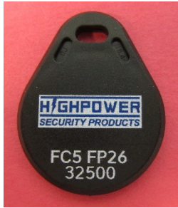
Highpower Select Fob in Black Part # HF-B Custom Laser Etched with your Logo Included or with Optional Full Color Printing